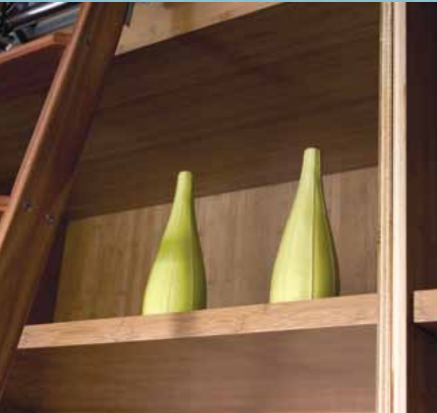
Library in the U.S. Green Building Council’s LEED® Platinum headquarters; fabricated using PureBond® veneer core hardwood plywood with bamboo veneers.

What really makes PureBond special is that it’s cost-competitive with the standard UF construc-