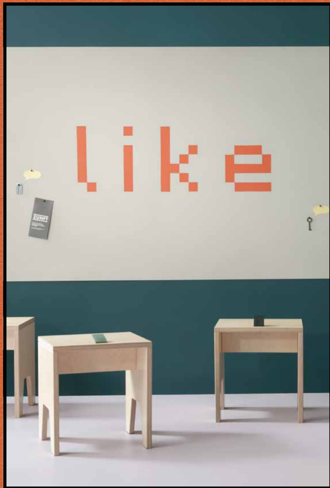
2206 | oyster shell 2211 | tangerine zest 3363 | walton lilac