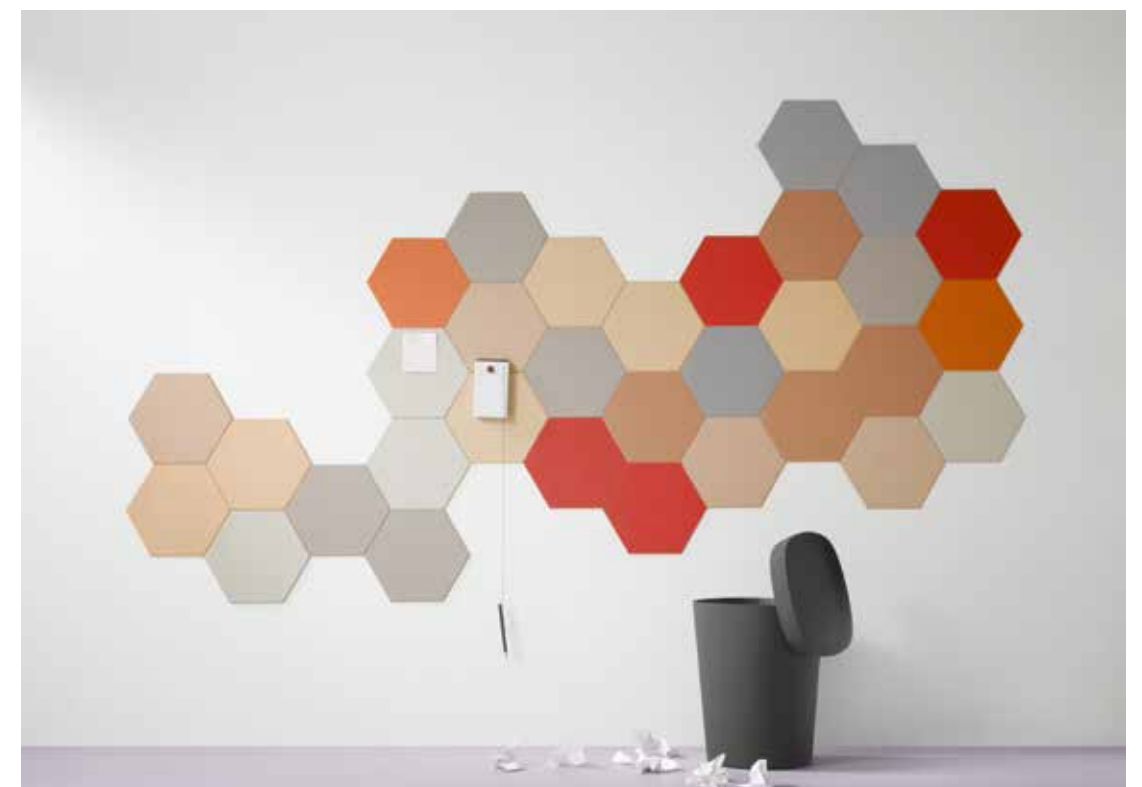
2210, 2207, 2166, 2162, 2206, 2182, 2187, 2186, 3363 | walton lilac

BULLETIN BOARD is flexible and easy to cut and handle, which allows you to create functional wall decorations with enchanting decorative effects.