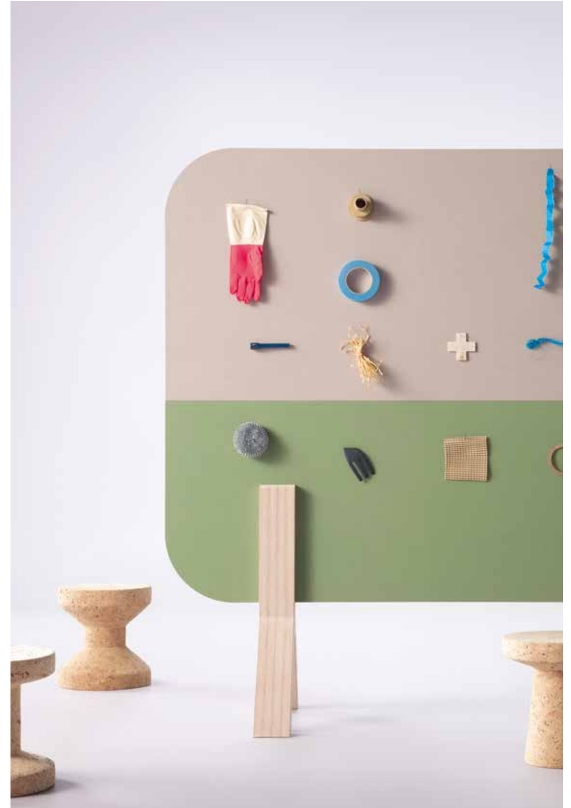
2187 | brown rice 2213 | baby lettuce 3363 | walton lilac

BULLETIN BOARD provides ideal solutions to the modern sustainable office environment where separation walls or furniture elements can double as information carriers.